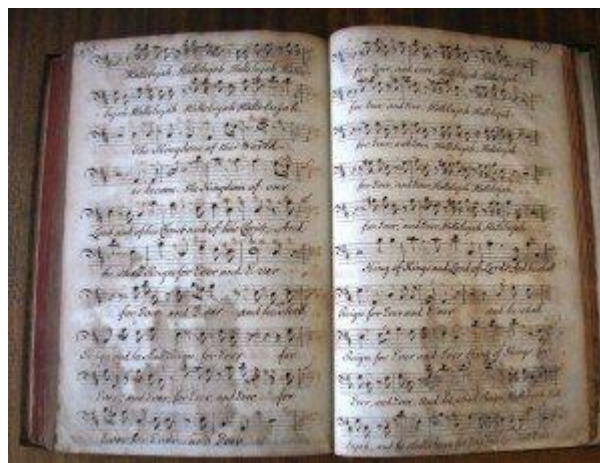
Handel’s Messiah – bass part; St Patricks Dublin