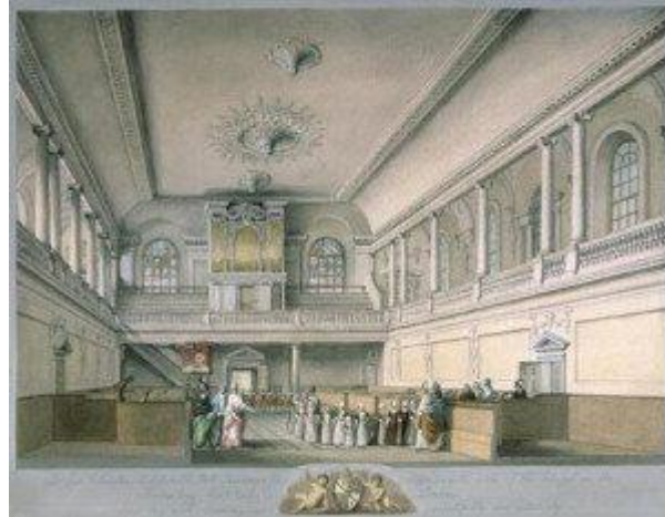
Foundling Hospital Chapel

Even in 1751, when the death of the Prince of Wales caused the closing of the theaters, Handel was permitted to give two performances of Messiah at the Foundling Hospital for another audience of 2,000. Both the chapel setting and the philanthropic purpose of these performances eased the minds of people discomforted by the performance of “a sacred oratorio” in a theater. Many shared the sentiments of socialite Catherine Talbot, who deemed Covent Garden “an unfit place for such a solemn performance” and extolled the virtues of the Foundling Hospital as a place “where the benevolent design and the attendance of the little boys and girls adds a peculiar beauty even unto this noblest composition.”