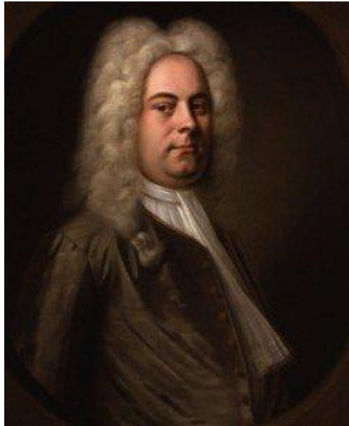
George Frideric Handel

More than two hundred years before music and philanthropy were joined in such events as The Concert for Bangladesh and We Are the World , George Frideric Handel used his “Sacred Grand Oratorio” Messiah to generate income for a number of worthy causes. The Dublin Journal writes of its premiere on April 13, 1742, “It is but Justice to Mr. Handel, that the World should know, he generously gave the Money arising from this Grand Performance, to be equally shared by the Society for relieving Prisoners, the Charitable Infirmary, and Mercer’s Hospital, for which they will ever gratefully remember his Name.”